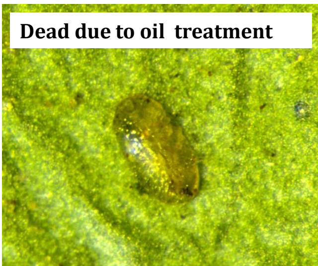
Dead due to oil treatment