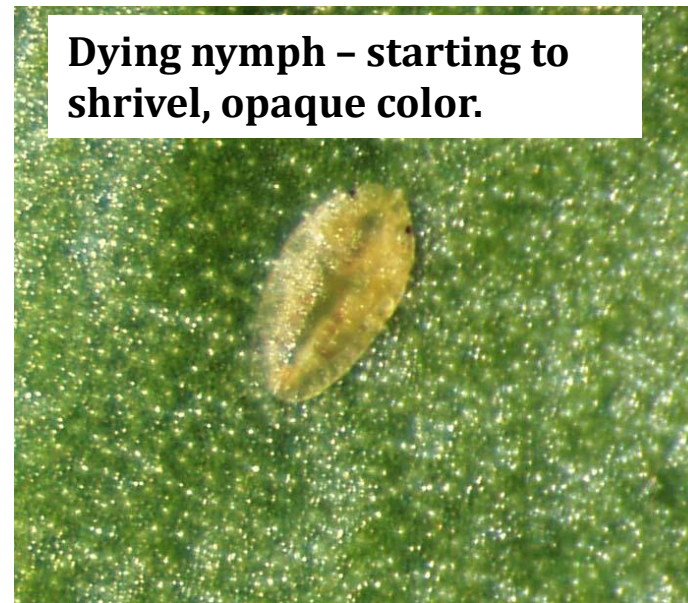
Dying nymph - starting to shrivel, opaque color.