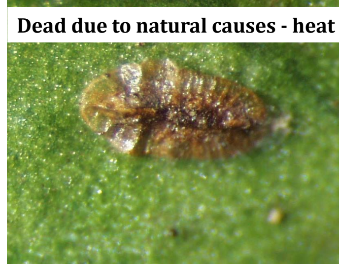
Dead due to natural causes - heat