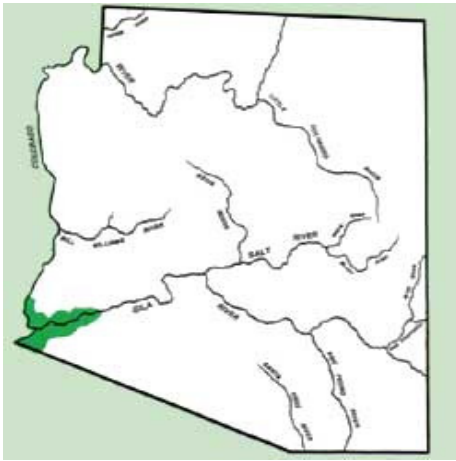
Figure 9.1. Lettuce Production Region of Arizona

The cooperating grower is a large lettuce producer in Yuma County, right in the heart of the prime vegetable growing region. The grower provided the following costs of production as a baseline comparison, which were the actual costs of production for the 2005-06 growing season for 1,563 acres of lettuce.